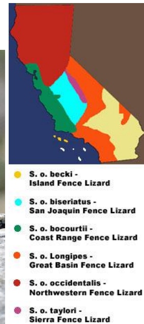
Figure 1: Adult male Sceloporus occidentalis longipes - Great Basin Fence Lizard, and a range map for the Great Basin Fence Lizard ( http://www.californiaherps.com/lizards/pages/s.o.longipes.html )